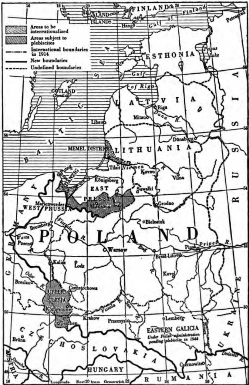
POLAND SHOWING ARRANGEMENTS AND DISPOSITIONS OF TERRITORY MADE BY THE PEACE CONFERENCE